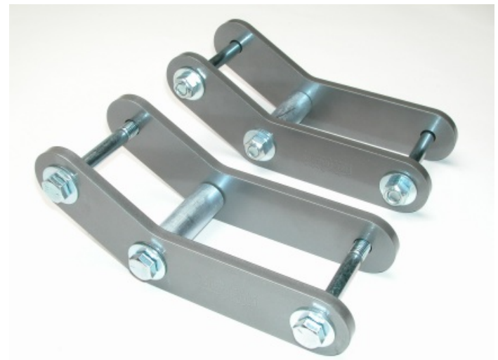
Rear Shackles Shown Assembled