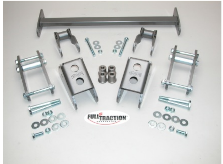
FTS2501 2" Lift Shackle Reverse Kit