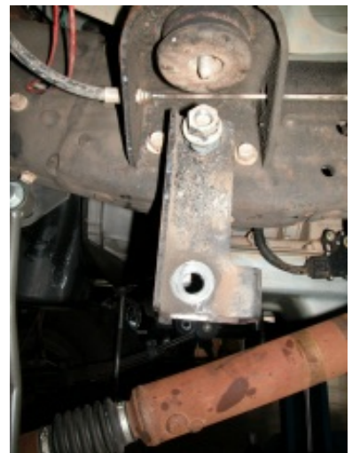
Drill out to 18mm