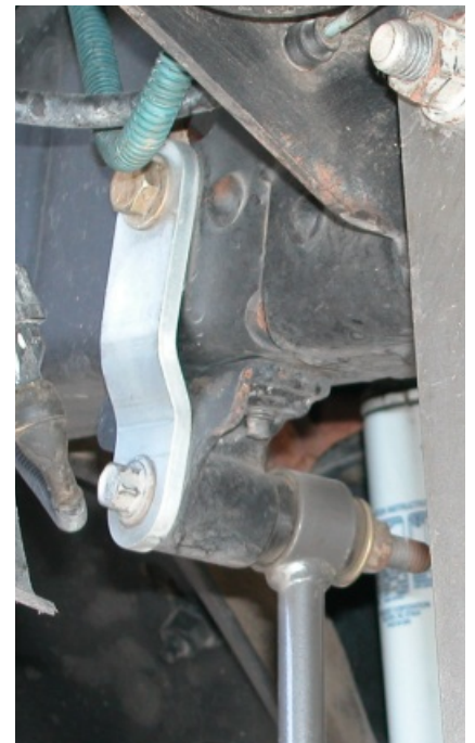
Invert factory bracket